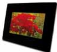
Digital picture frame

A few examples of gifts for sponsors and sponsorees alike: